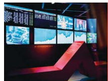
The Swiss Finance Museum is presenting a retrospective of 30 years of Swiss economic history to celebrate the milestone anniversary of the SMI. The special exhibition, featuring items including original stock and bond certificates issued by companies in the blue-chip index, runs until mid-2019. → finanzmuseum.ch