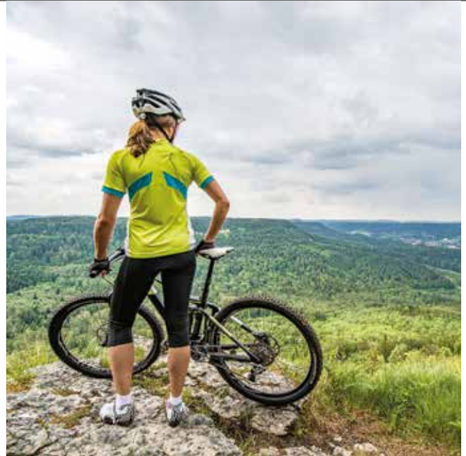
From the new PaymentStandards.CH imagery

That is not recommended. The software vendors are in a key